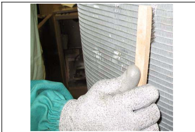
FIGURE 2: Clean Leak Area