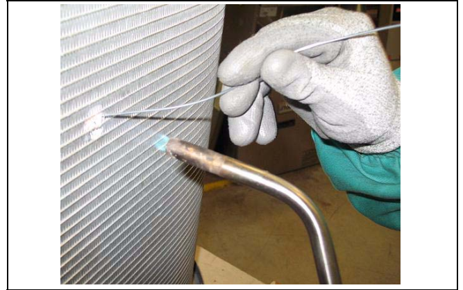
FIGURE 3: Repair Leak